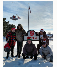
Service Learning at the Salvation Army