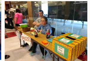
Working the table at the Taste of Transition fair