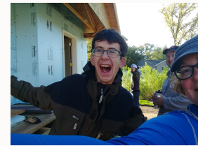
Working at Habitat for Humanity Fall 2018

Our community participation includes activities that reinforce citizenship, services and healthy recreation choices. New Frontier students join with students from other programs in the area for events and have opportunities for leisure and recreational activities. Students spend time orienting to services in the community that will be useful as independent adults.