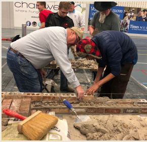
Career Trial Event