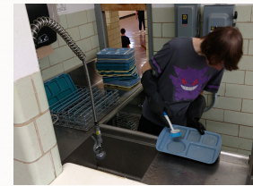
On the job, learning responsibility at Voyagers

Students prepare for work responsibilities through on the job training. Students learn skills by participating with an onsite work crew and through service learning in the community. Students practice team work, quality expectations, and take their turn organizing and directing others by being the crew leader.