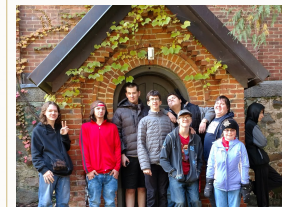
Out and about in the community for a college visit

New Frontiers offers exploration of opportunities after high school. Students may tour colleges or programs, participate in career fairs, and technical job activity events on the St. Cloud Technical College campus. Students develop connections with community organizations such as DEED for job skill assessments and trial work experiences.