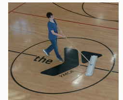
On the job experience, placement through DEED